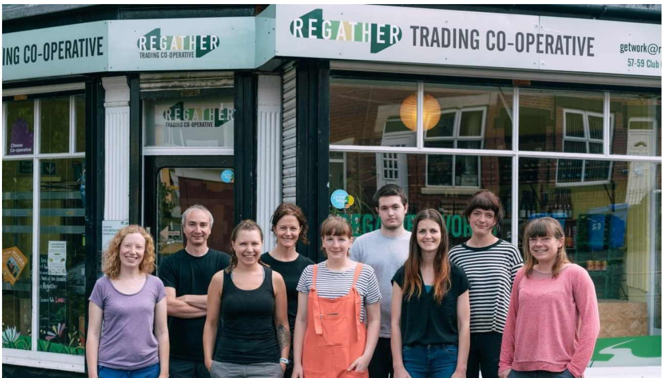
Regather, Club Garden Road, Sheffield