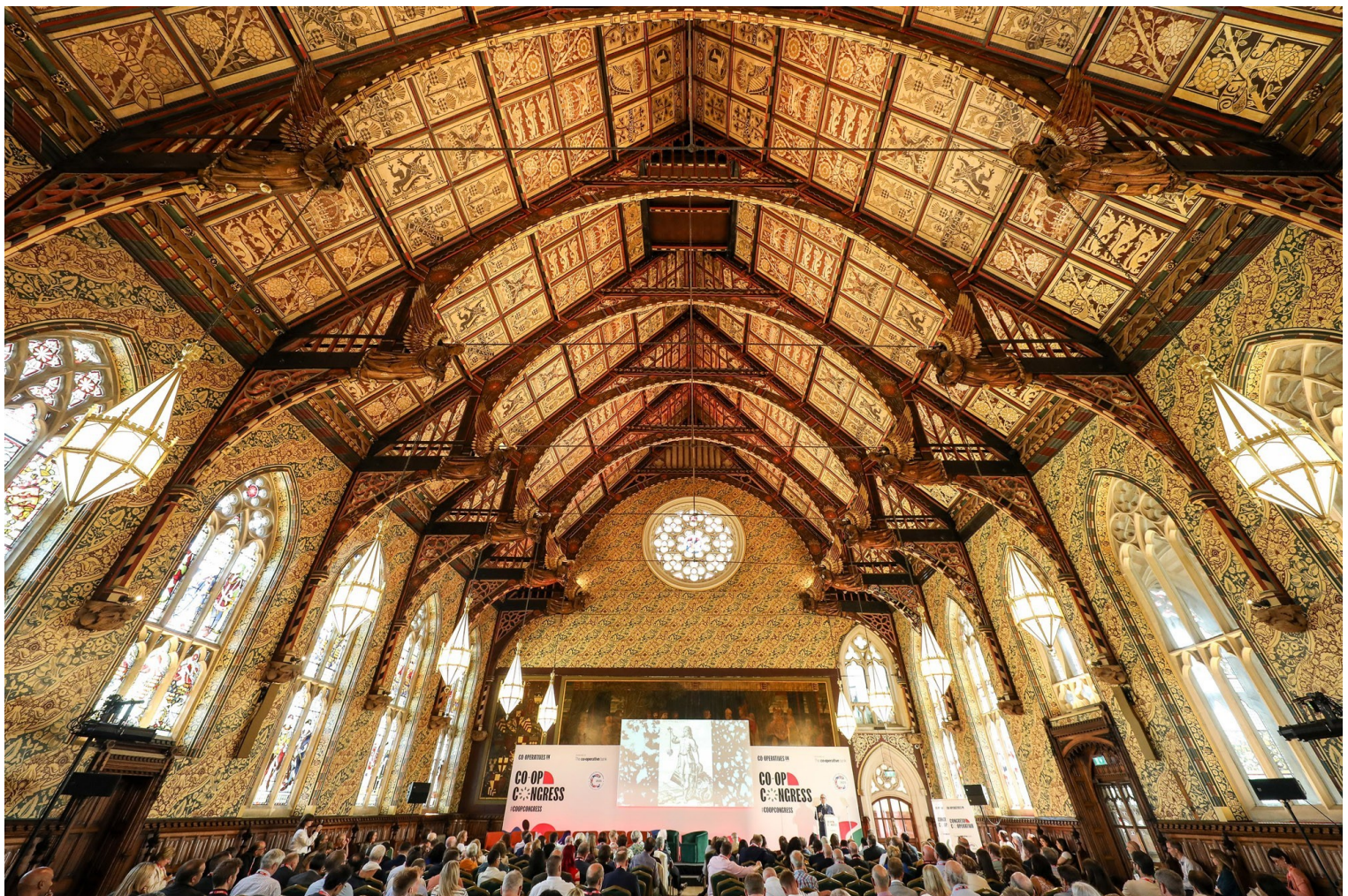
Rochdale Town Hall