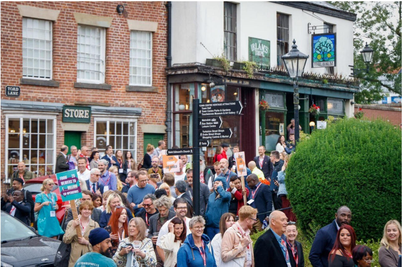
Co-operators on parade from the Rochdale Pioneers Museum to Rochdale Town Hall