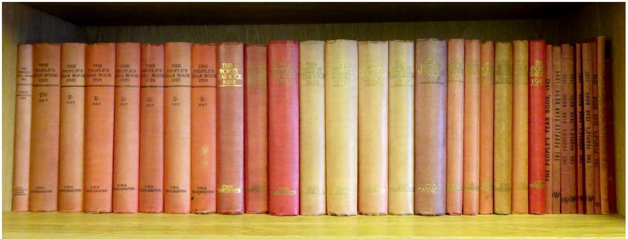
The People's Year Books