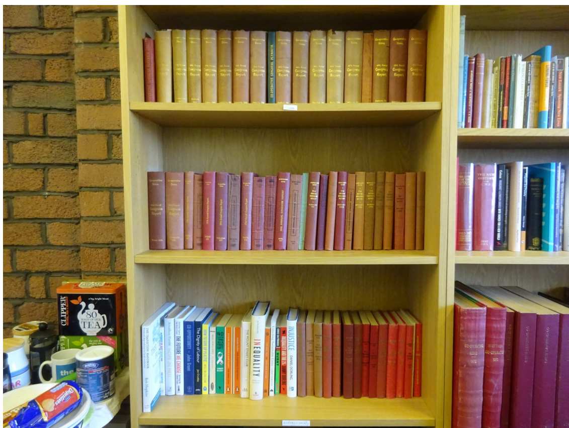
Co-operative Congress Reports