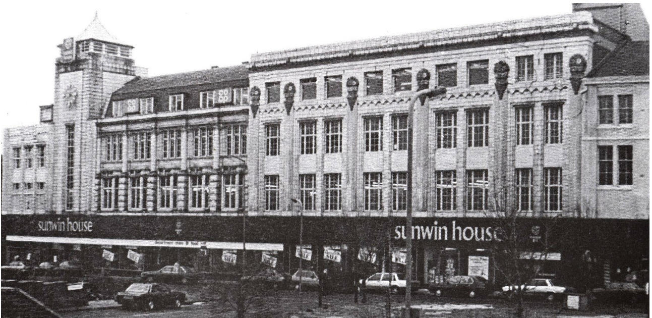
Sheffield & Ecclesall Co-operative Society Central Stores known as The Arcade and later as Sunwin House