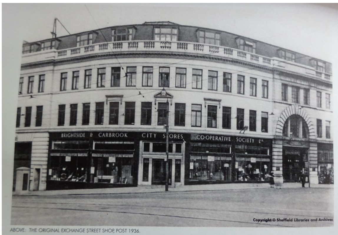
ABOVE: THE ORIGINAL EXCHANGE STREET SHOP, POST 1936.

After purchasing the site of Sheffield Castle B&C Co-op opened their city department store in 1929. It only lasted 11 years before being destroyed by enemy action in December 1940.