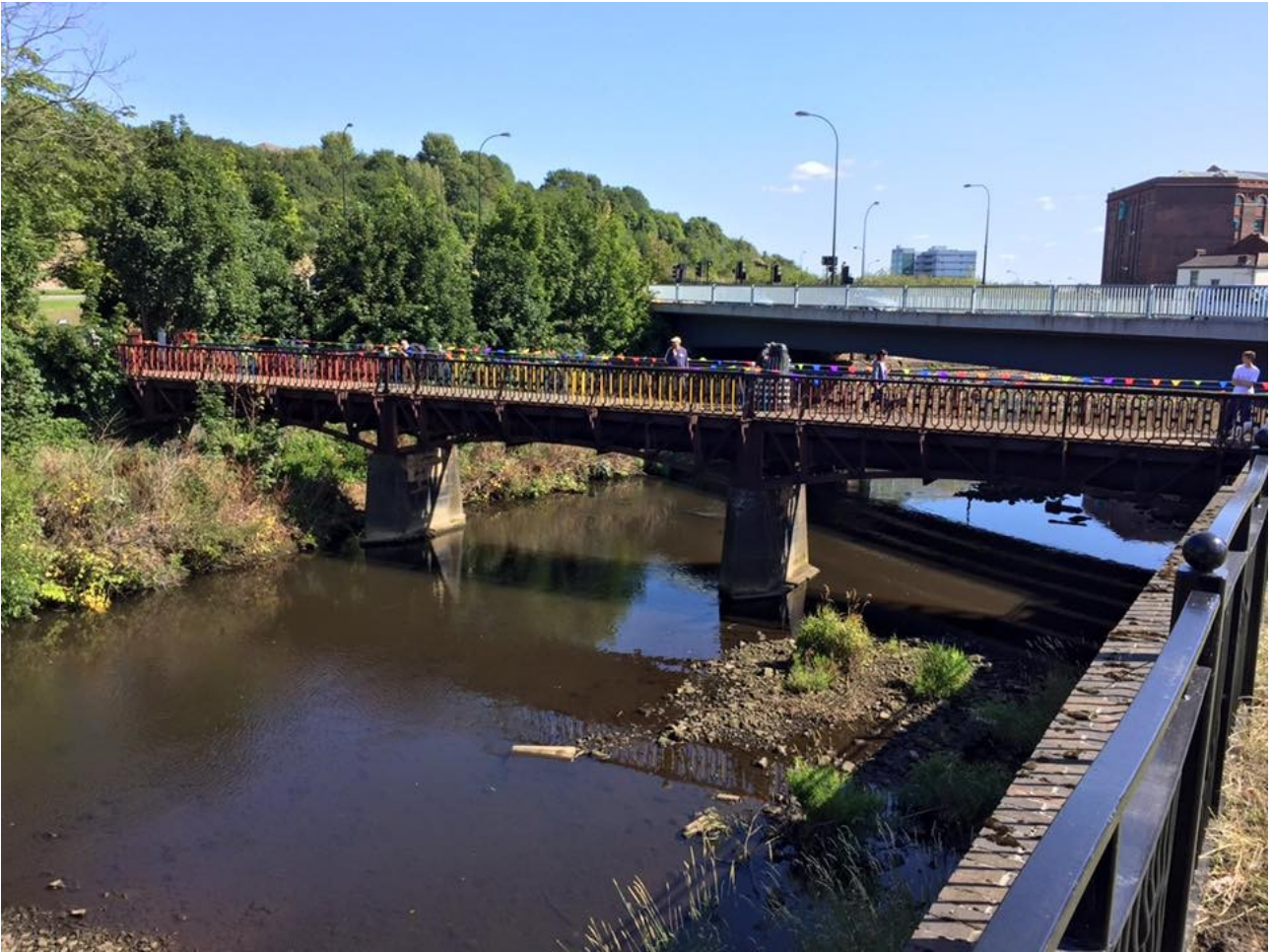
Bridgehouses Footbridge crossing the River Don (showing Aizlewood's Mill in top right hand corner)