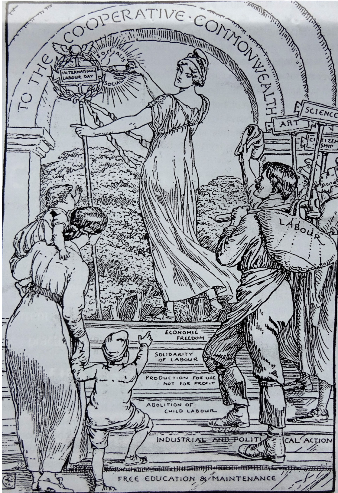
Walter Crane. From article in Co-op News Jan 2006